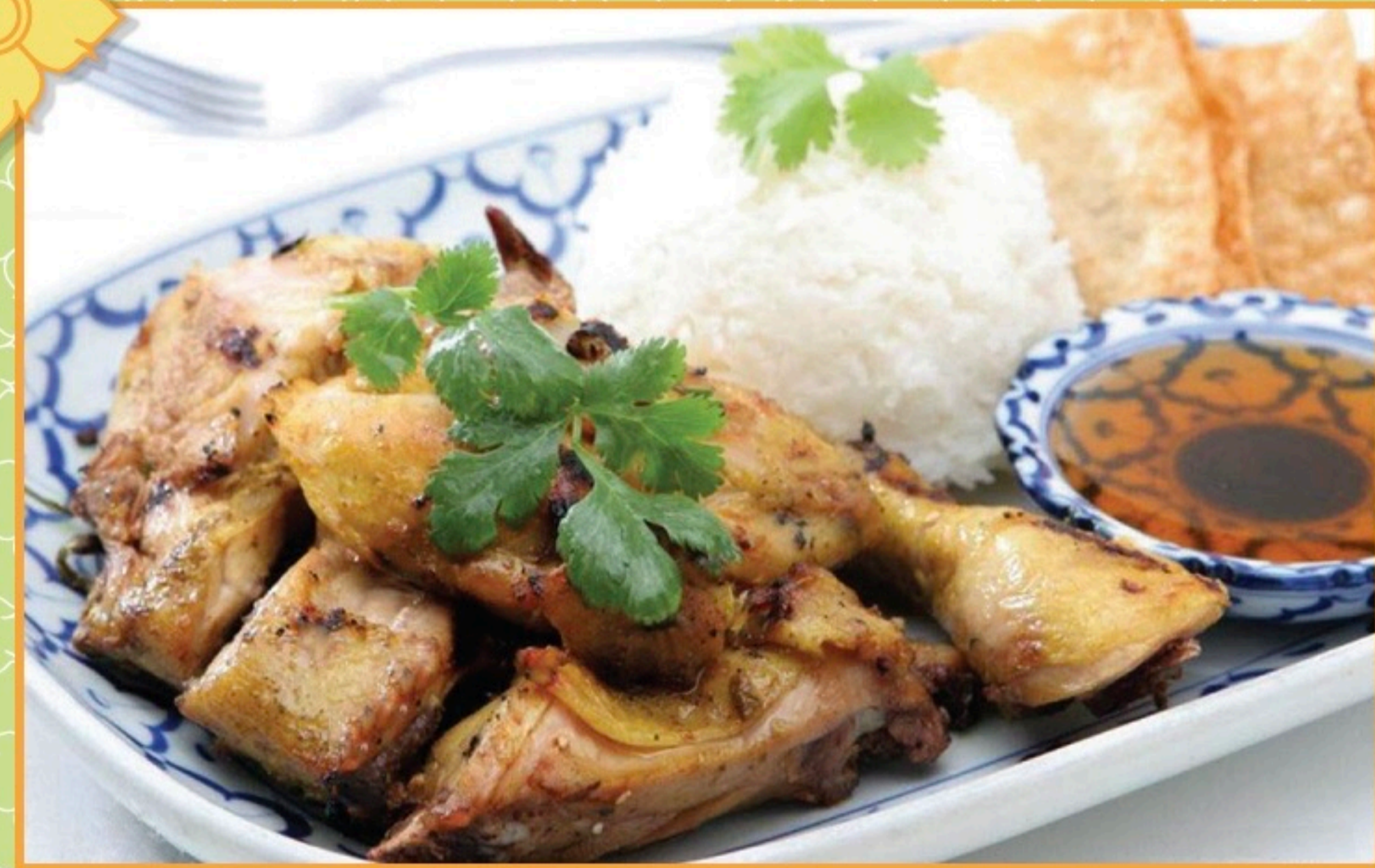
PRESIDENT'S B.B.Q CHICKEN