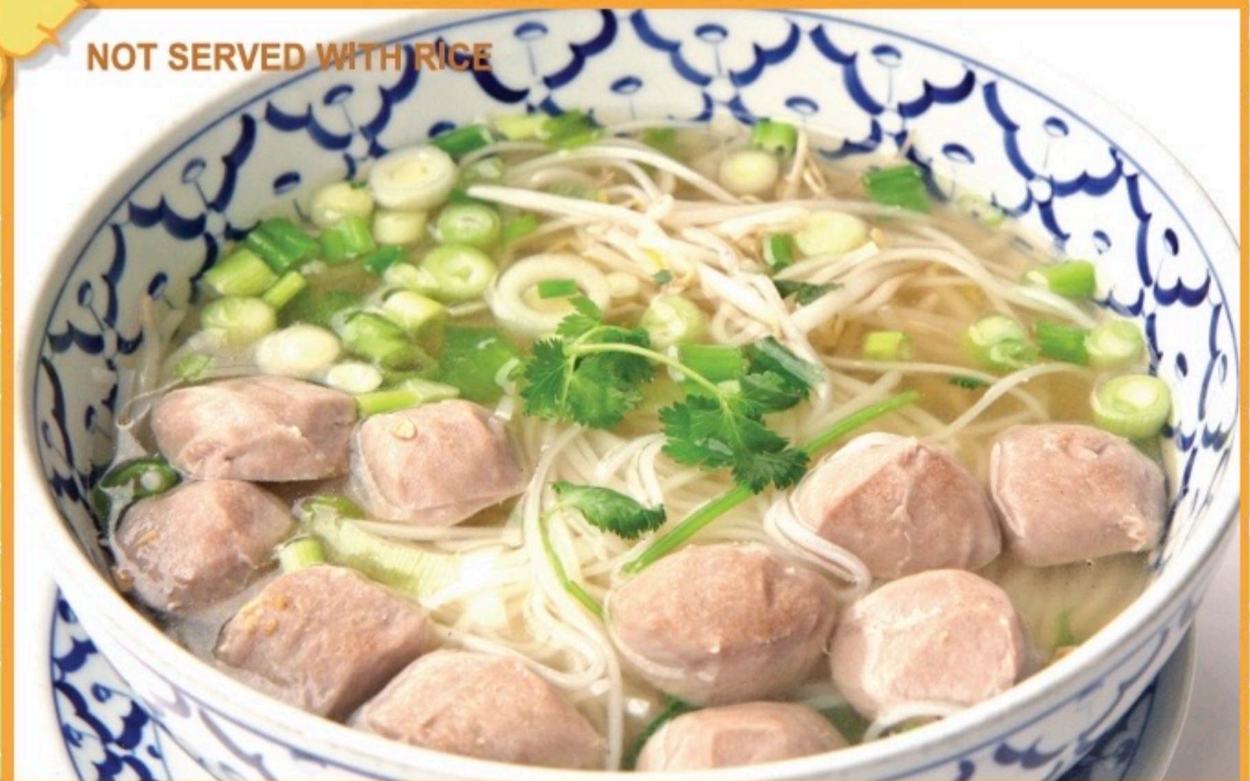
MEAT BALL NOODLE SOUP WITH CLEAR BROTH $15.50