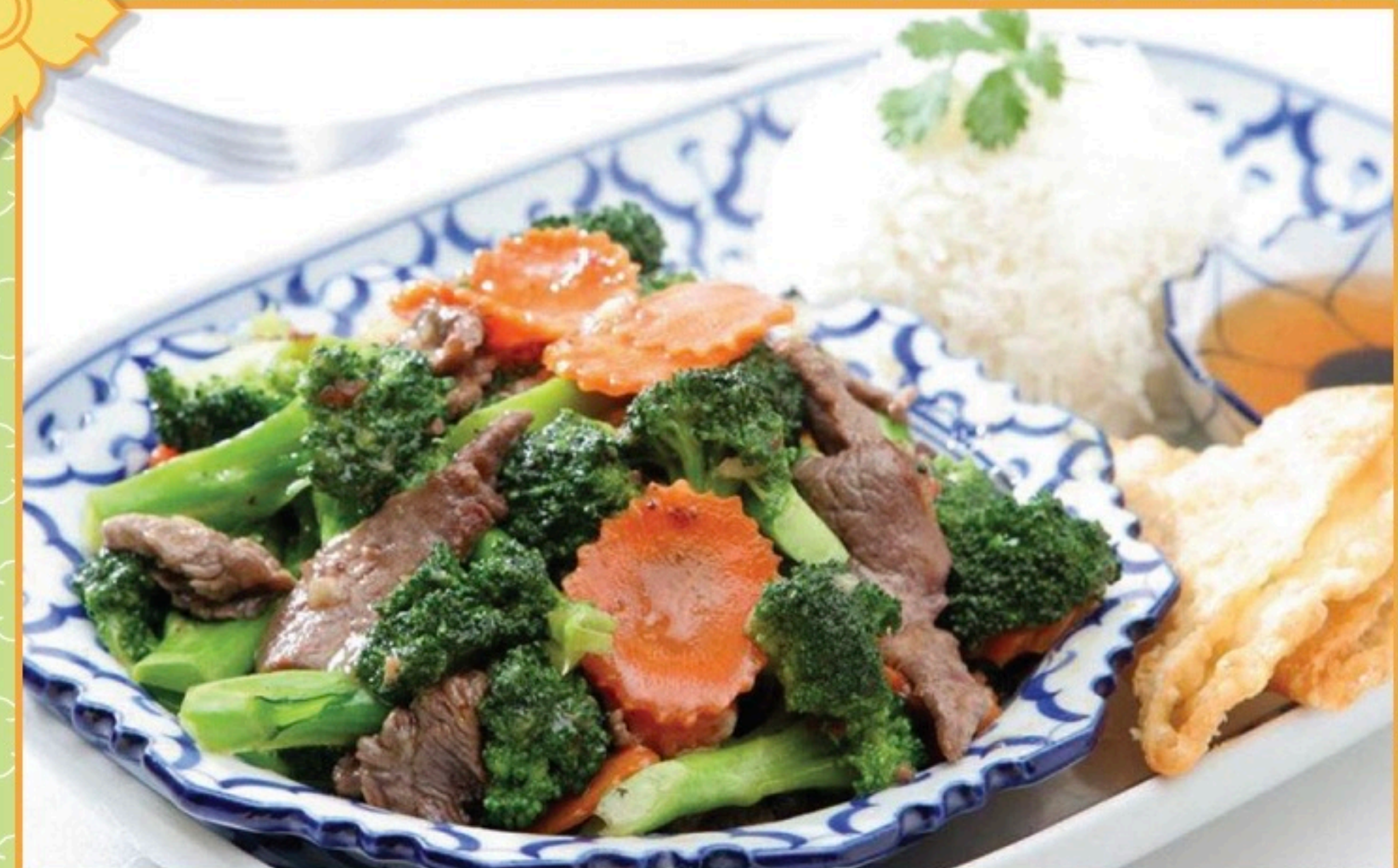
BEEF BROCCOLI $16.50