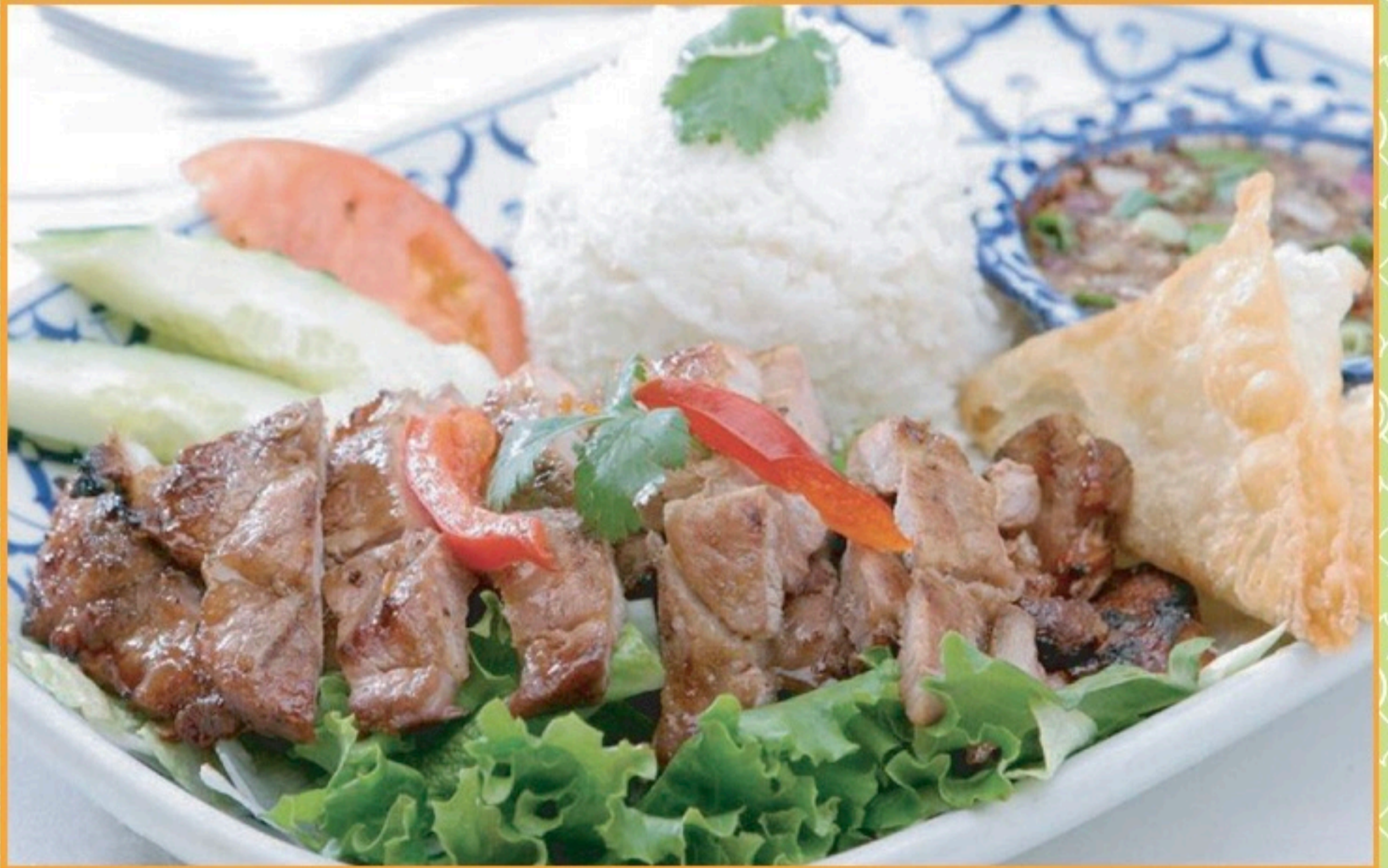
★ MOO YANG ( GRILLED PORK)