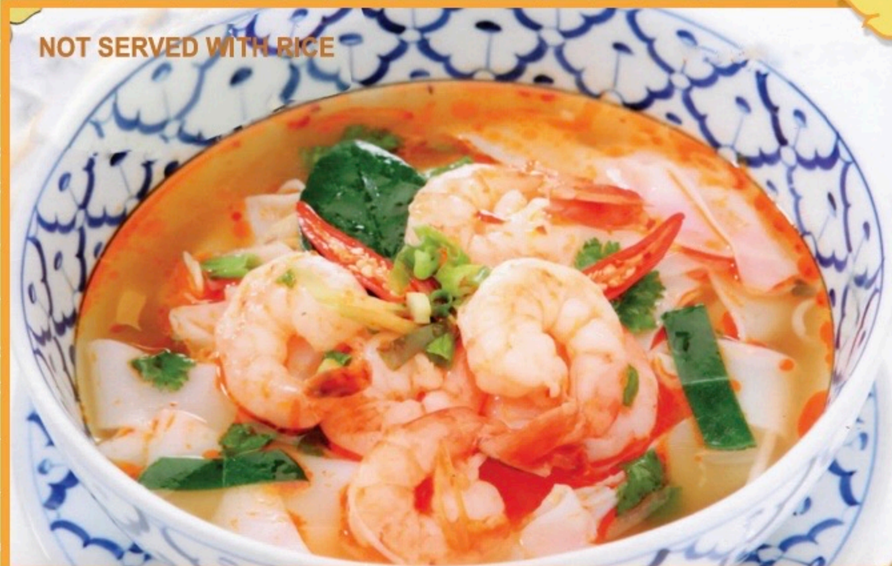
★ TOM YUM GOONG NOODLE SOUP $16.50