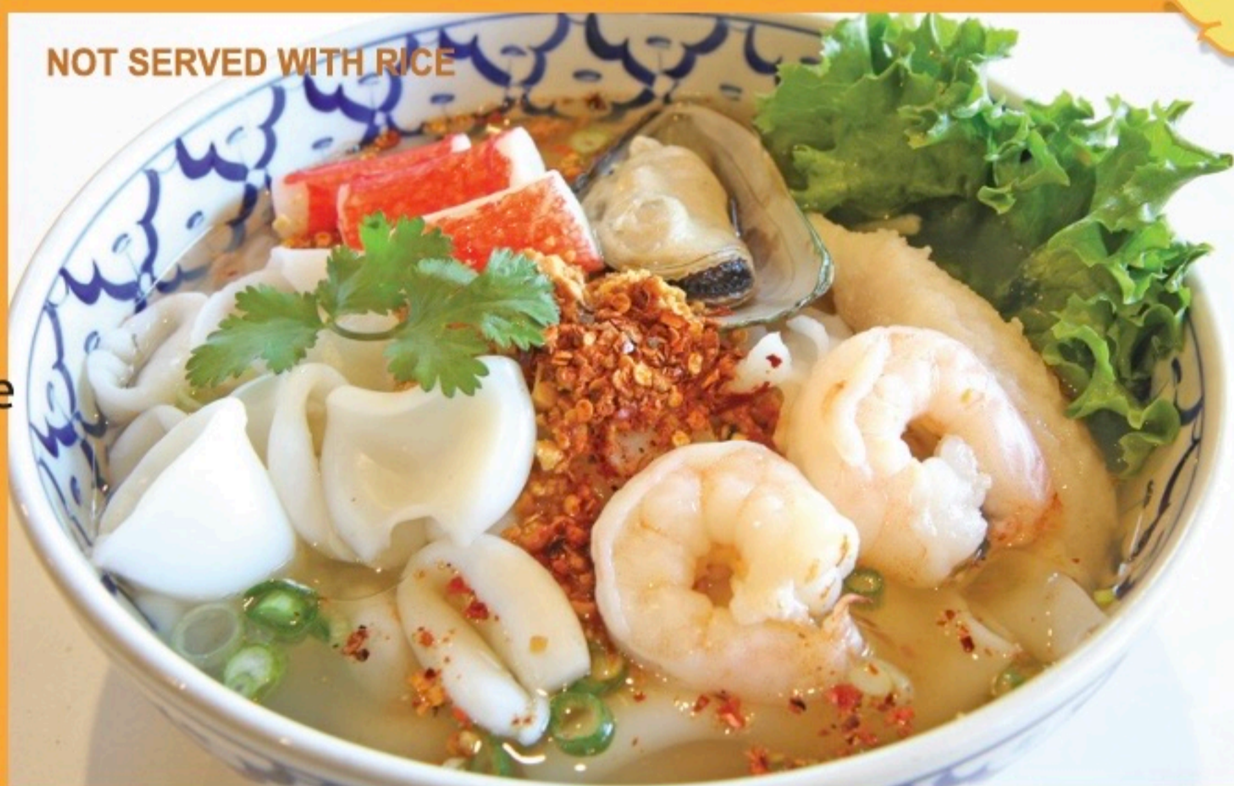
SEAFOOD NOODLE SOUP $17.50