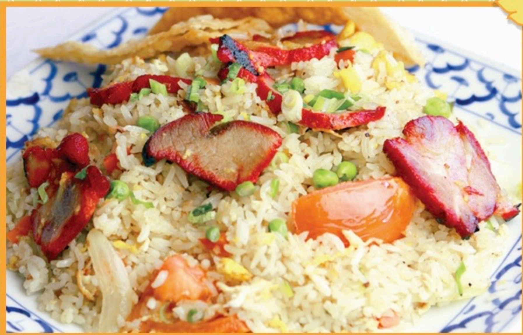
B.B.Q PORK FRIED RICE