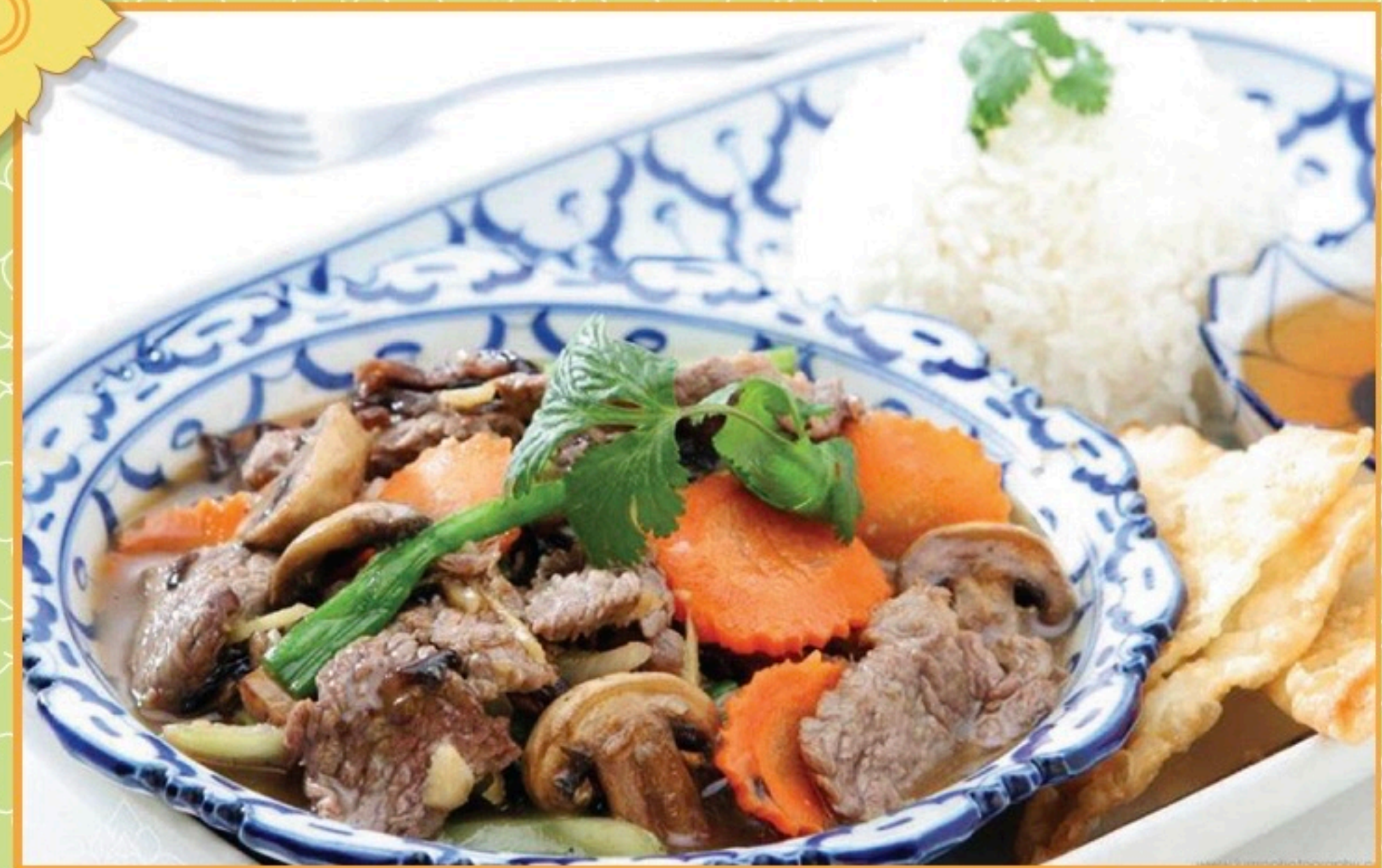
GINGER BEEF WITH ONION $16.50