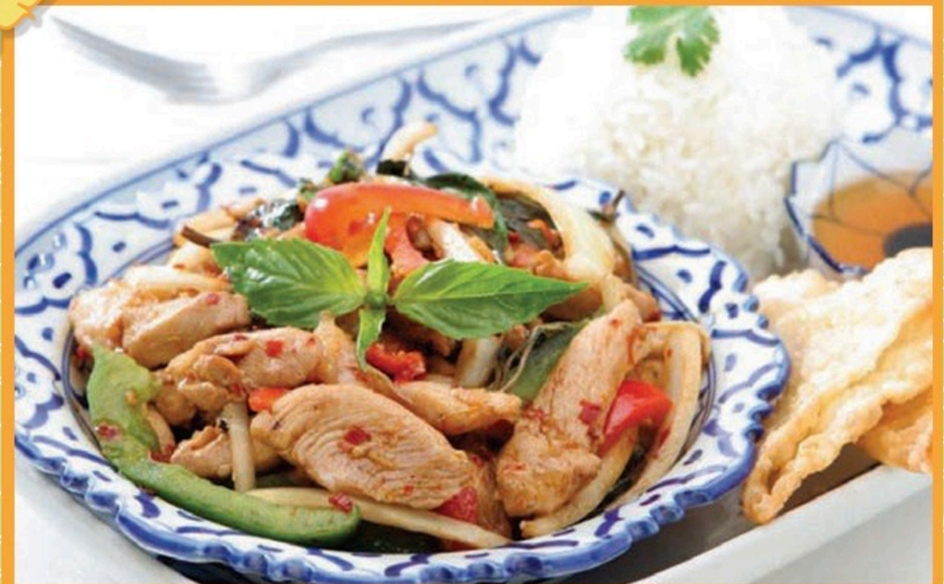
★ BASIL LEAVES AND CHILLI (CHICKEN OR TOFU) $16.50