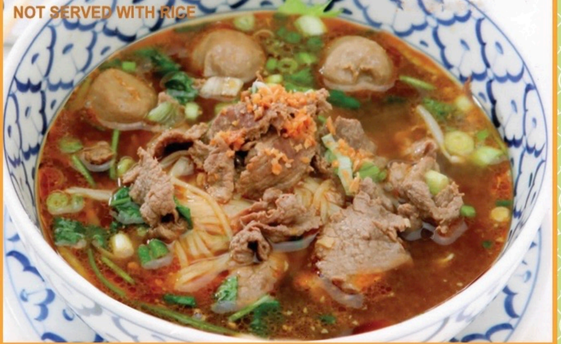
BEEF AND MEAT BALL NOODLE SOUP $16.50