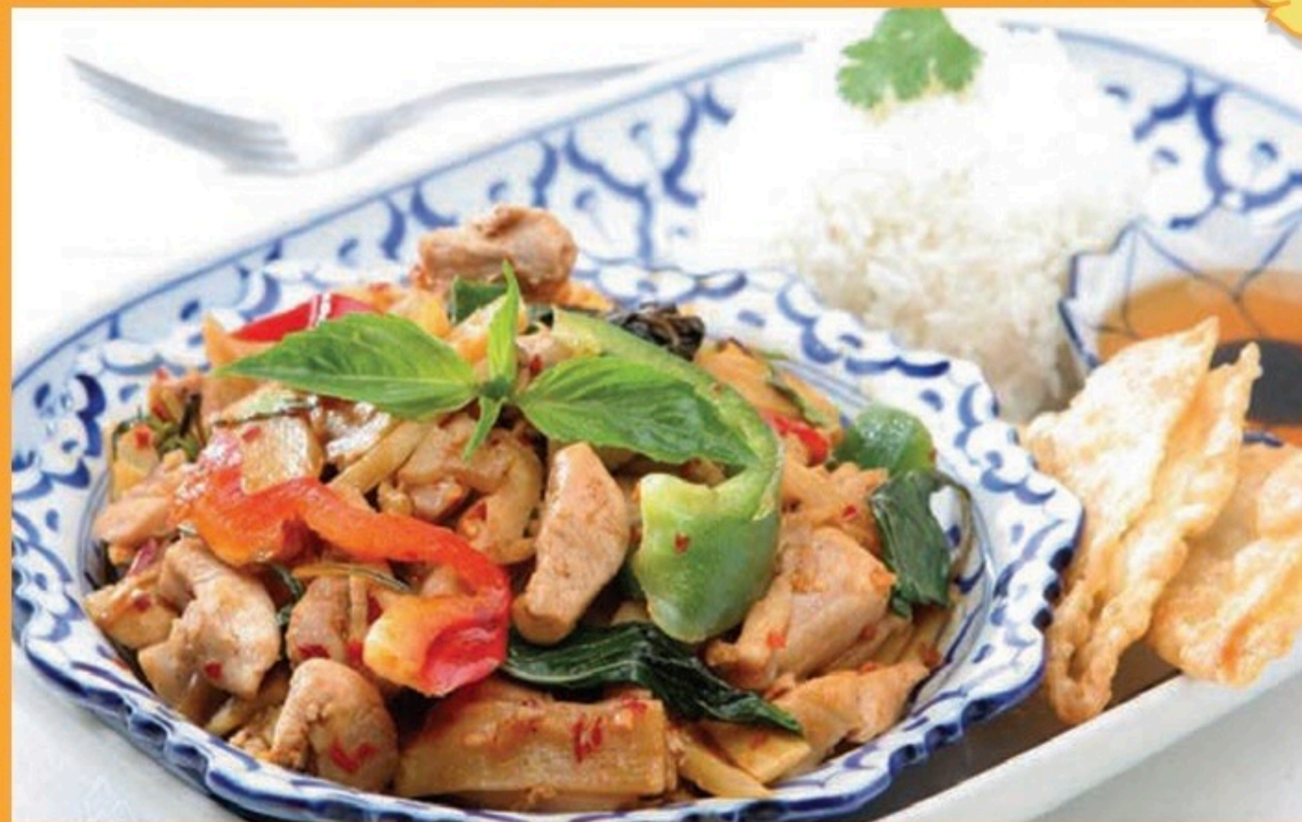
★ PAD PED BAMBOO SHOOT (CHICKEN OR TOFU) $16.50