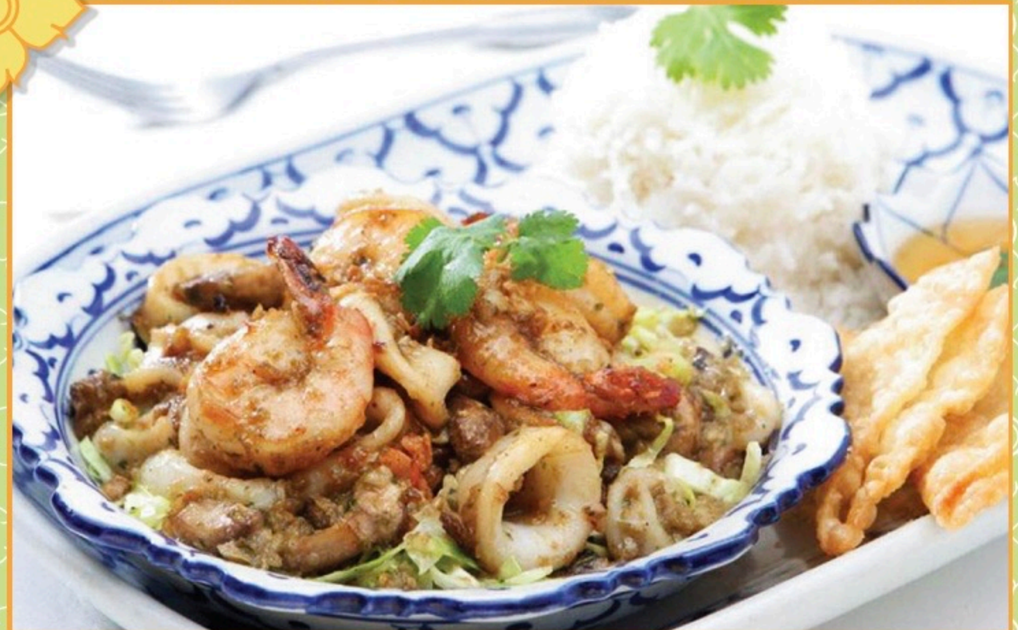
★ GARLIC SHRIMP & SQUID $17.50