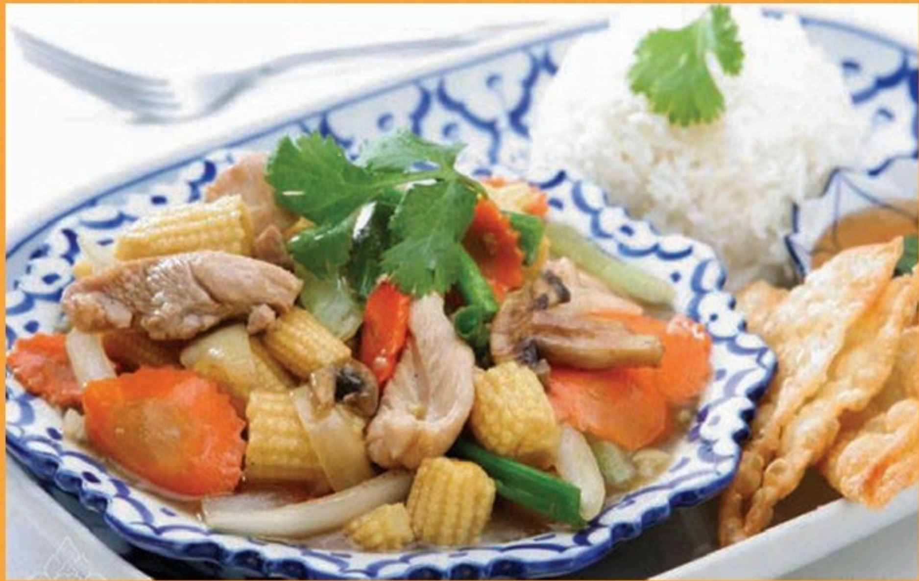
BABY CORN WITH CHICKEN & MUSHROOM $16.50