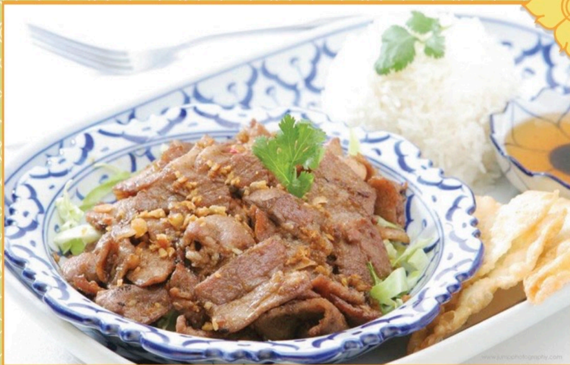
★ GARLIC PORK