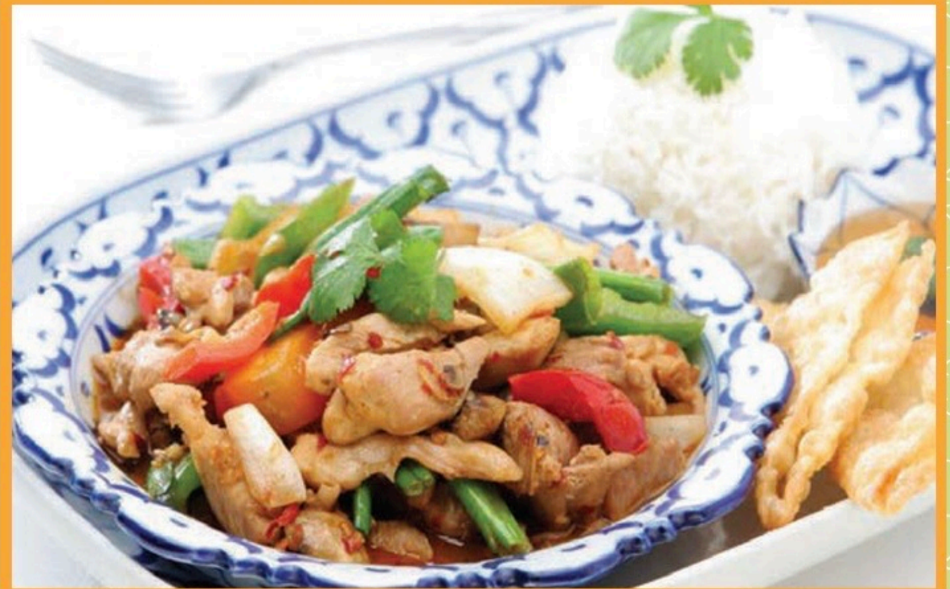
★ PAD PRIK CHICKEN $16.50