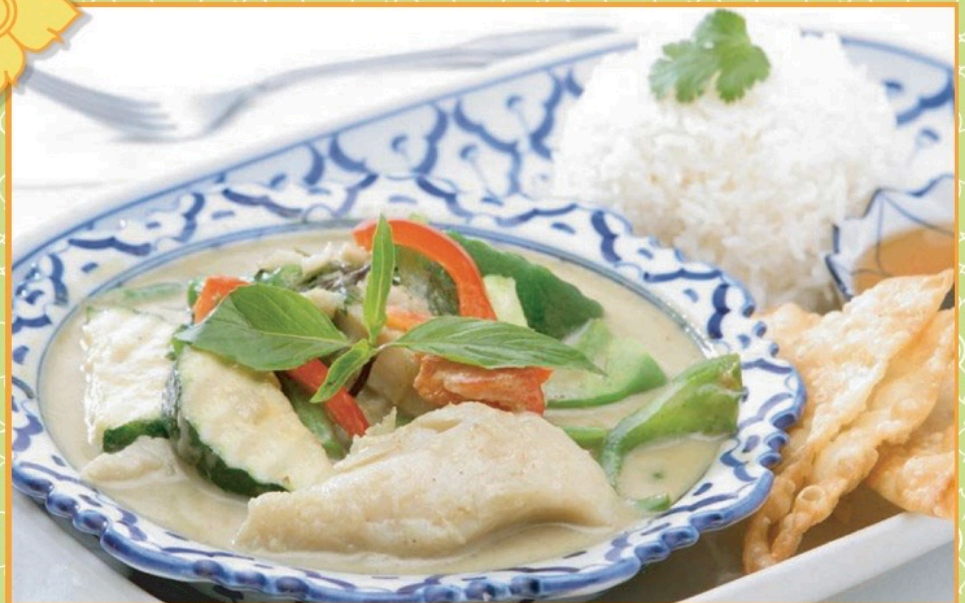
★ GREEN CURRY SOLE FILLET $17.50