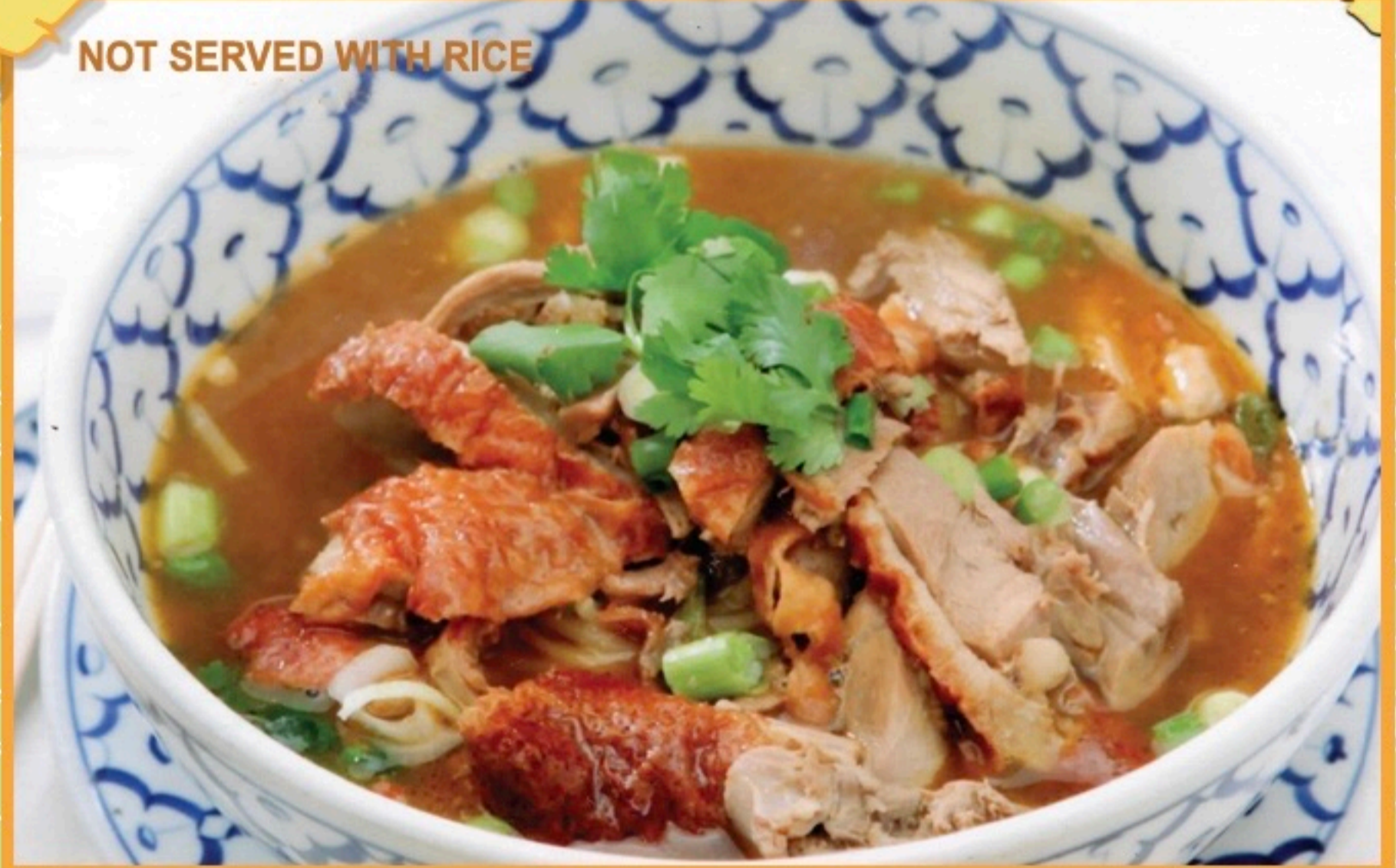
DUCK NOODLE SOUP $15.50