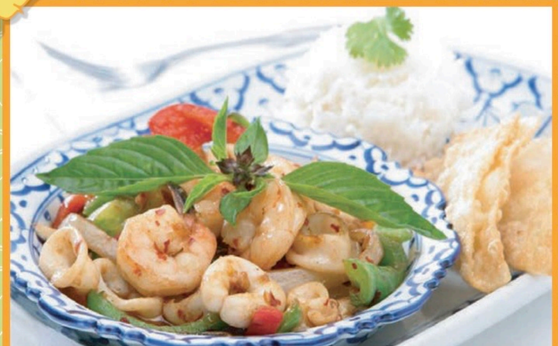
★ BASIL LEAVES WITH SHRIMP AND SQUID $17.50