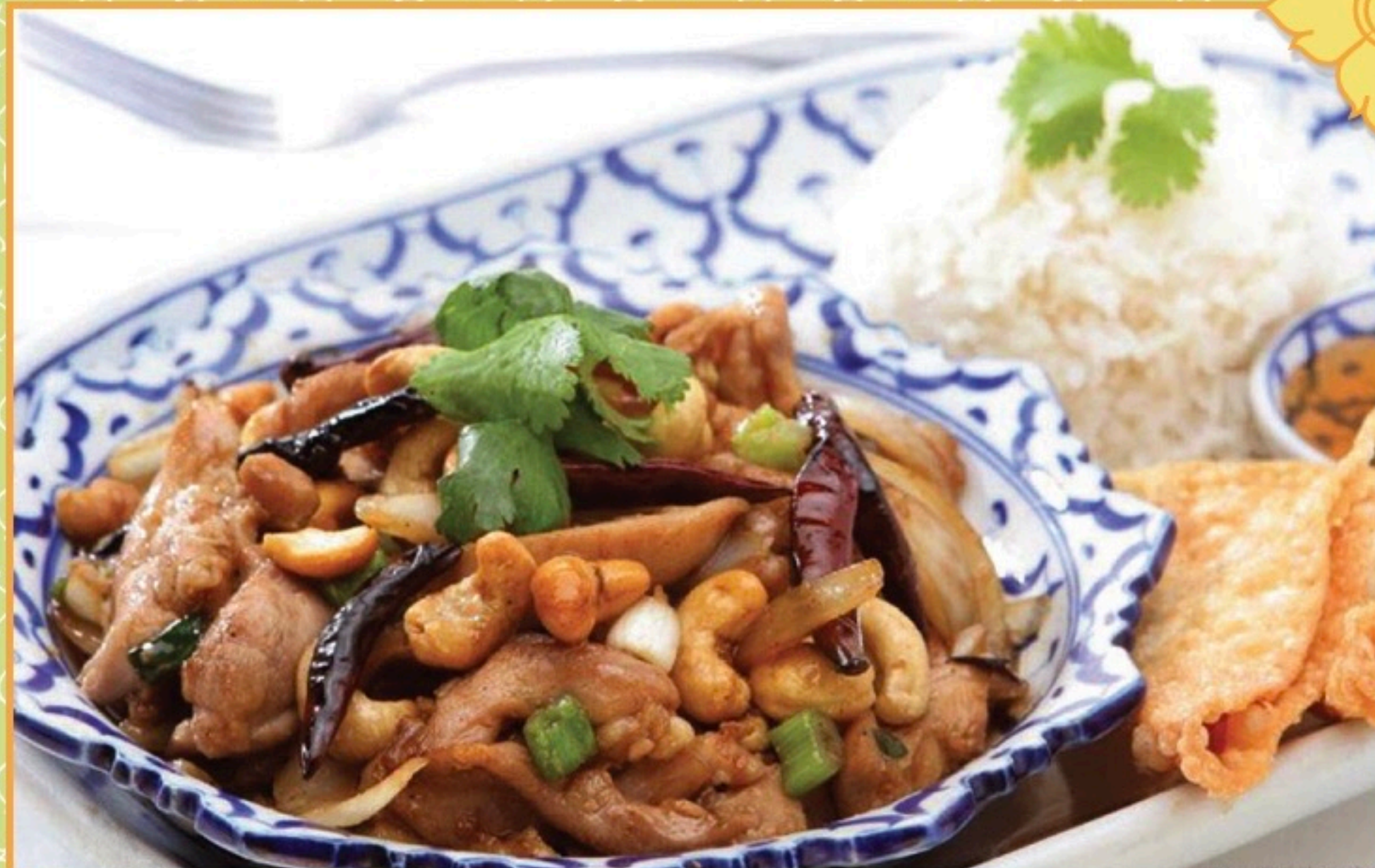
CASHEW CHICKEN $16.50