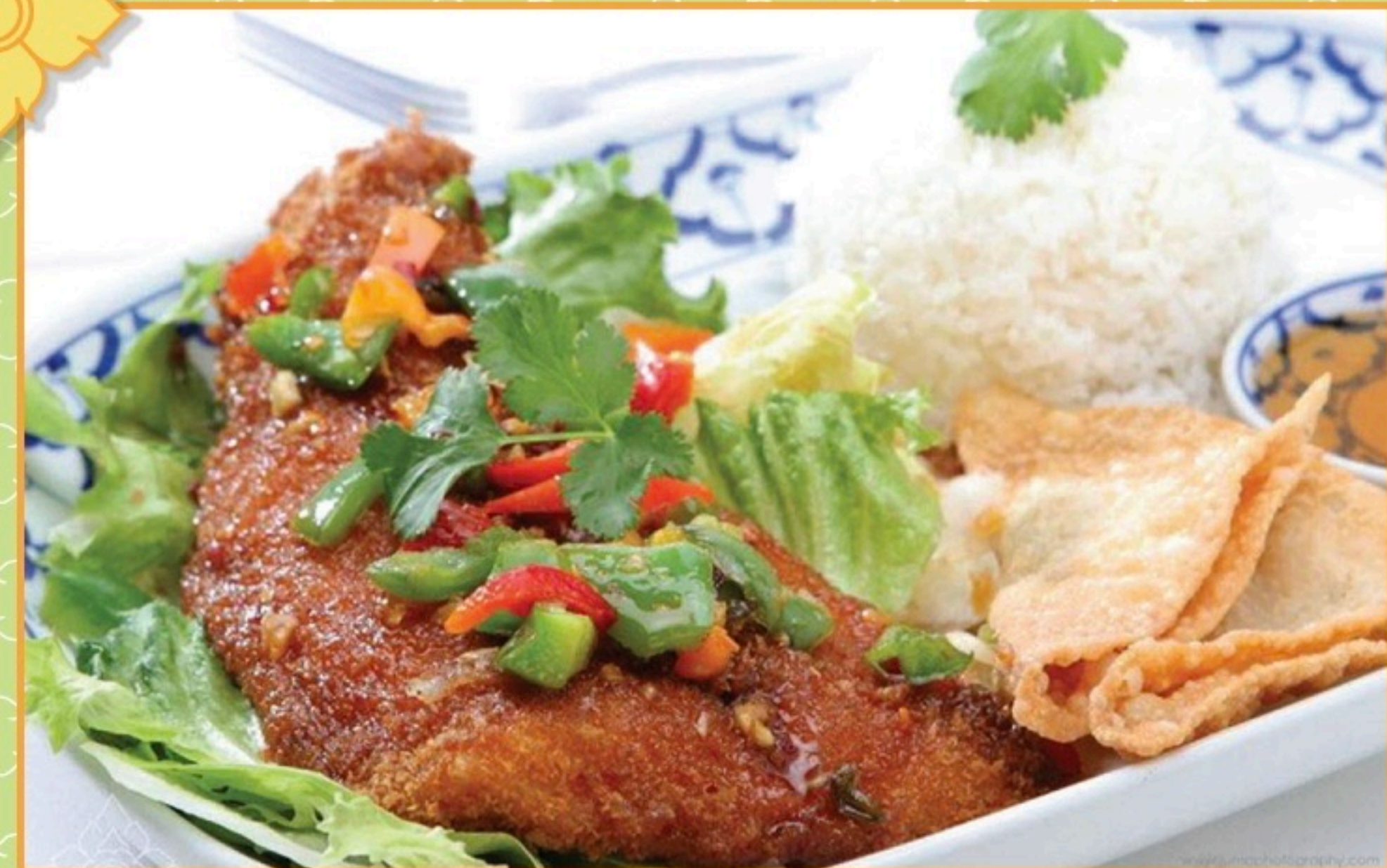
★ THREE FLAVORED FISH FILLET