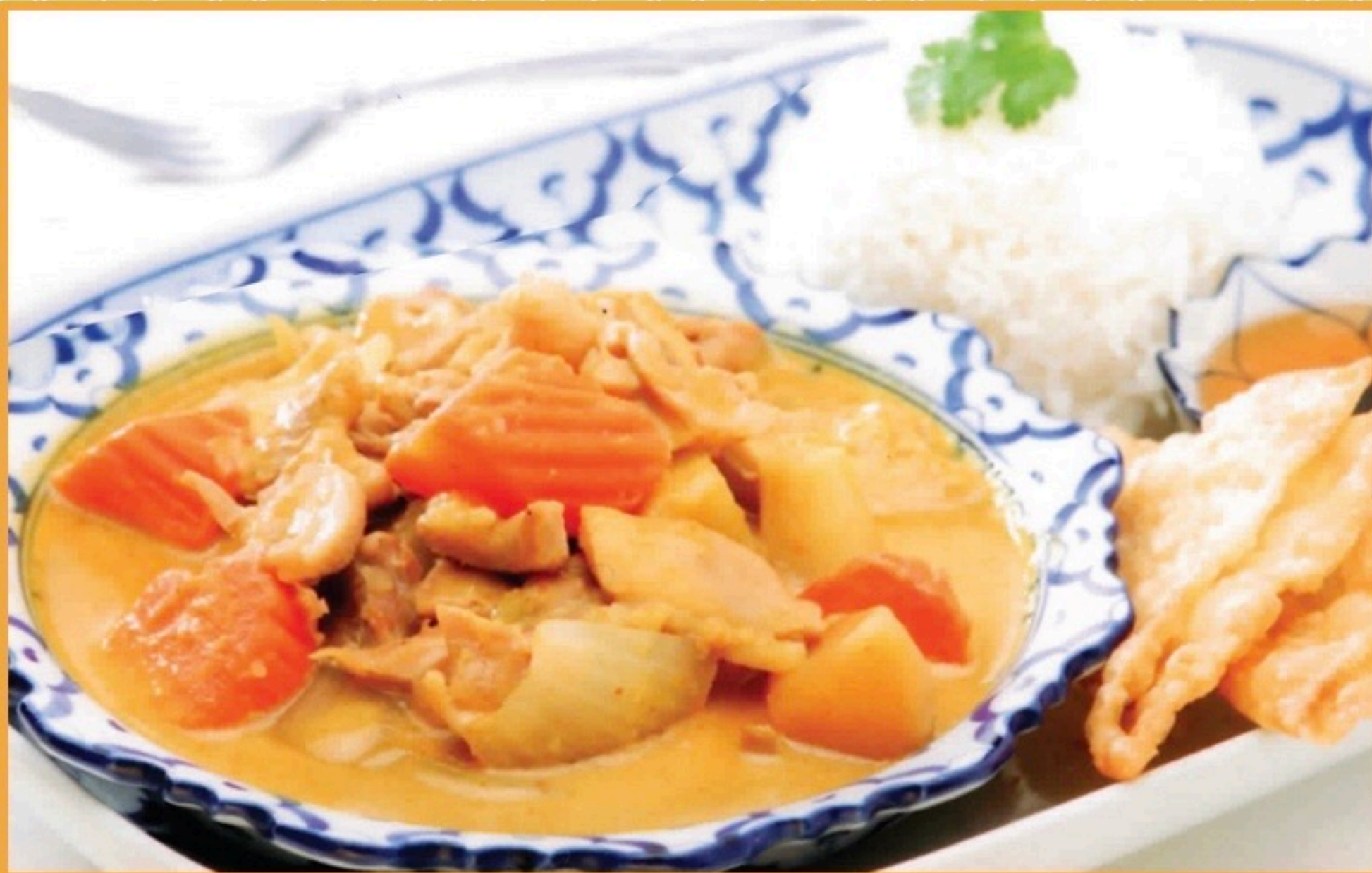
★ YELLOW CURRY (CHICKEN, TOFU OR VEGETABLE) $16.50