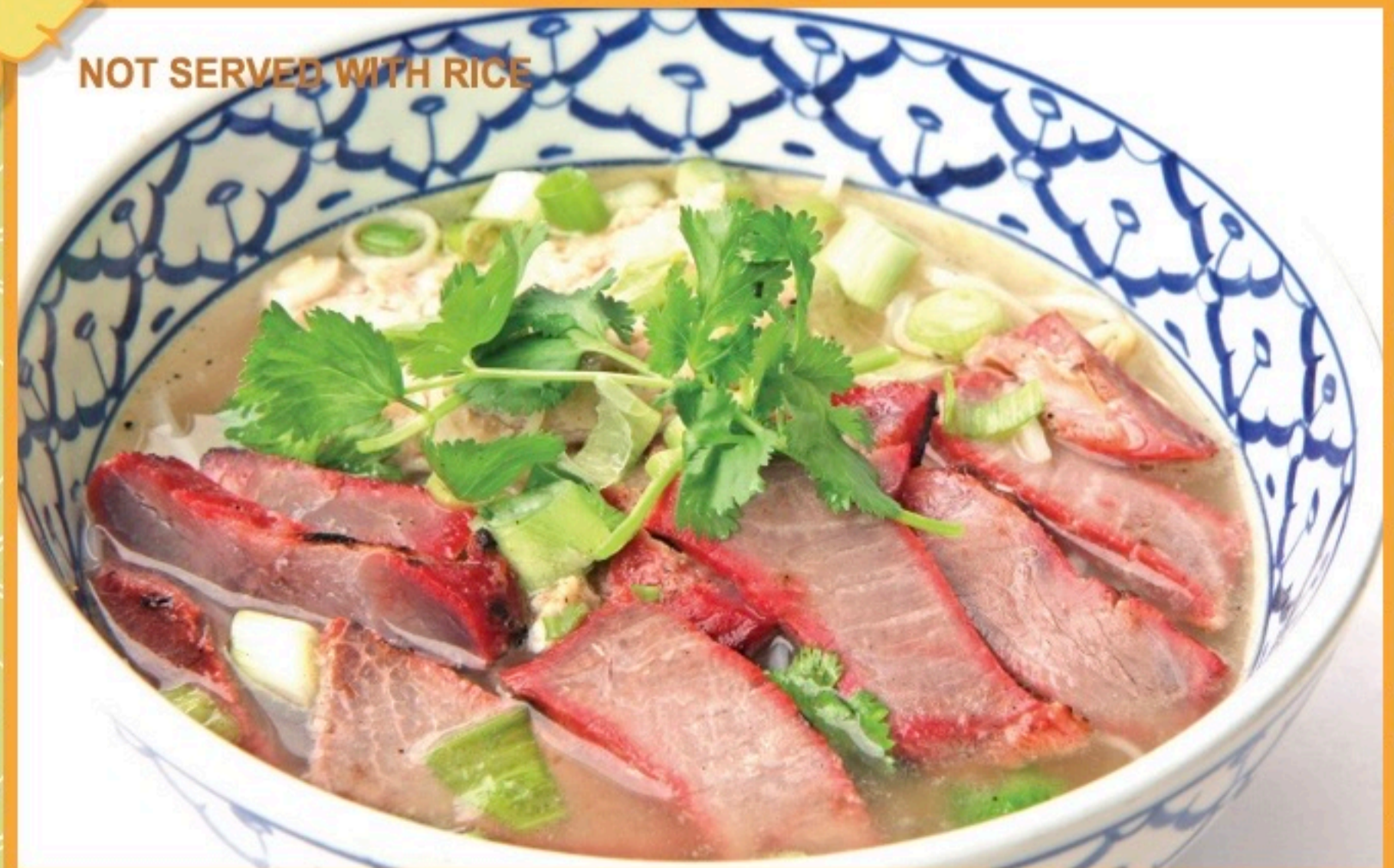
BBQ PORK NOODLE SOUP $15.50