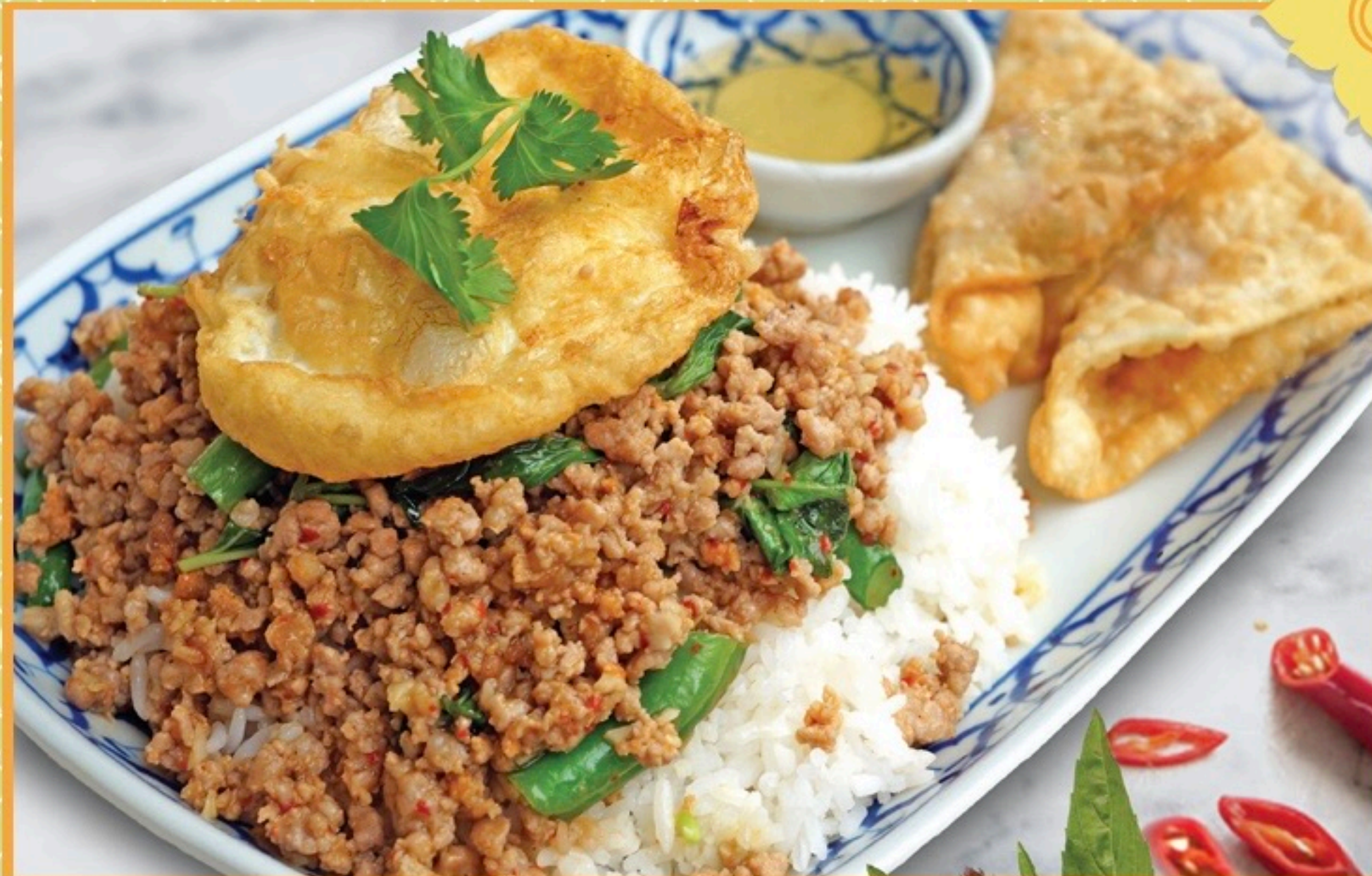
★ THAI STYLE BASIL GROUND PORK $17.50