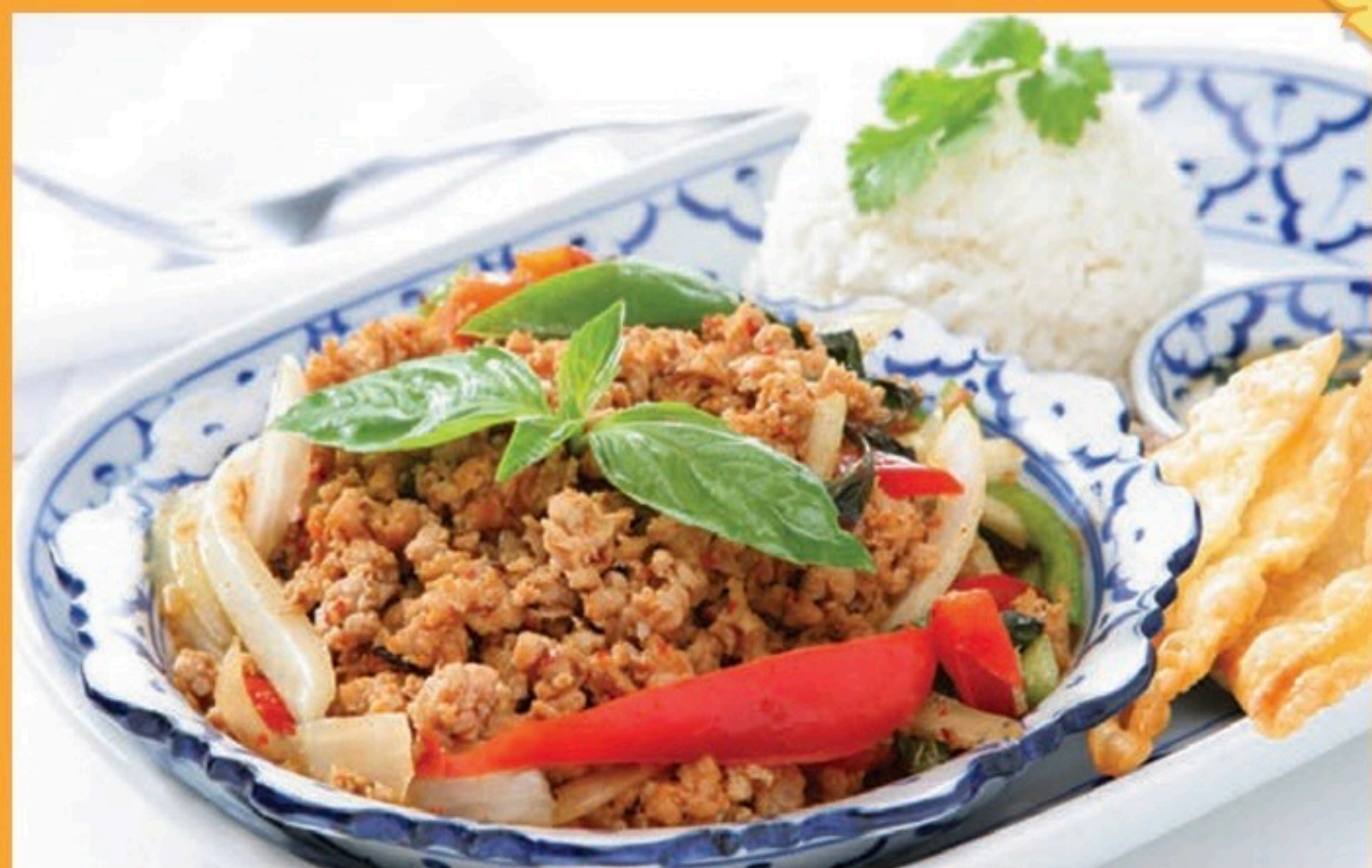
★ BASIL LEAVES WITH GROUND CHICKEN $16.50