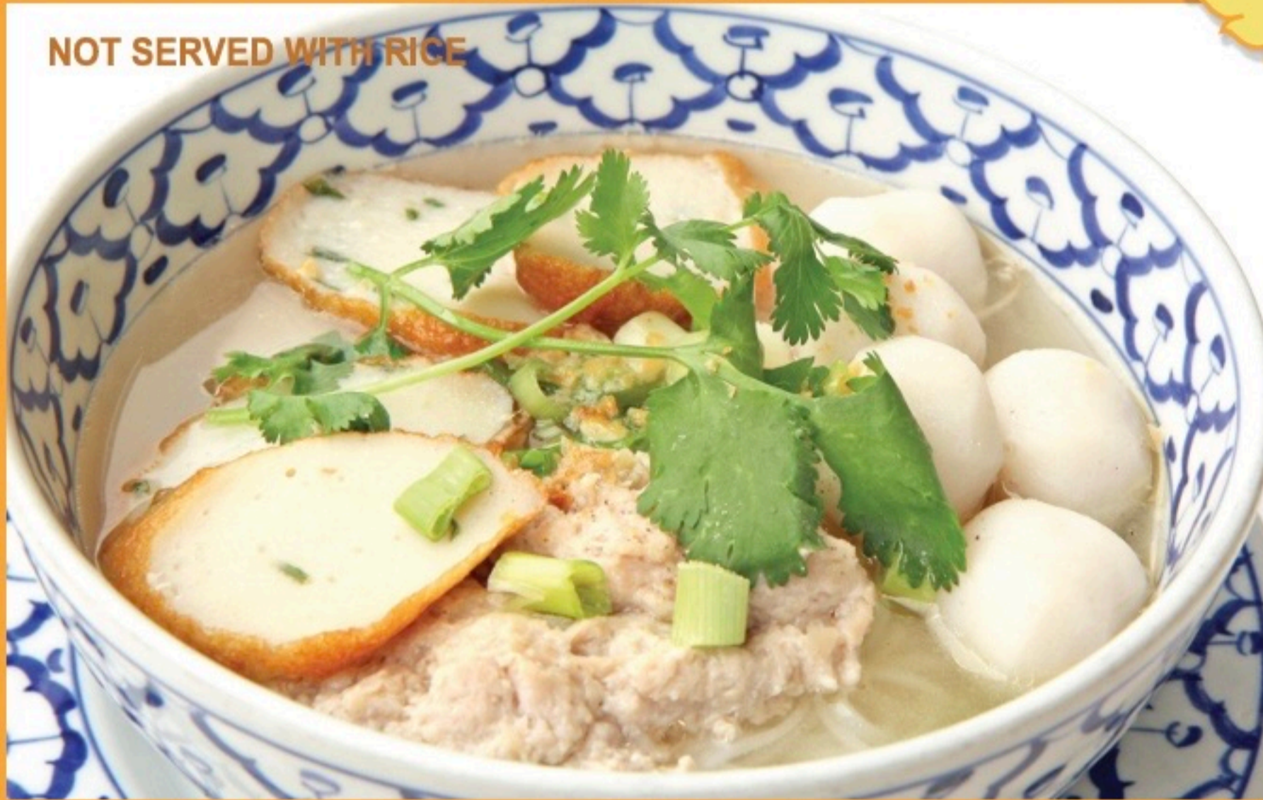
FISH BALL NOODLE SOUP $15.50