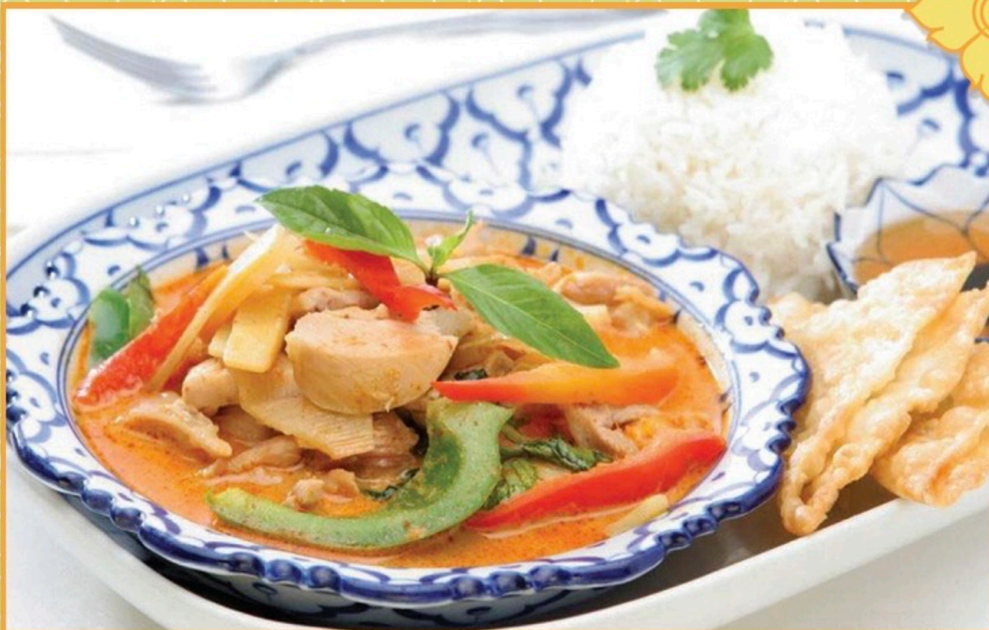
★ RED CURRY (CHICKEN, TOFU OR VEGETABLE) $16.50