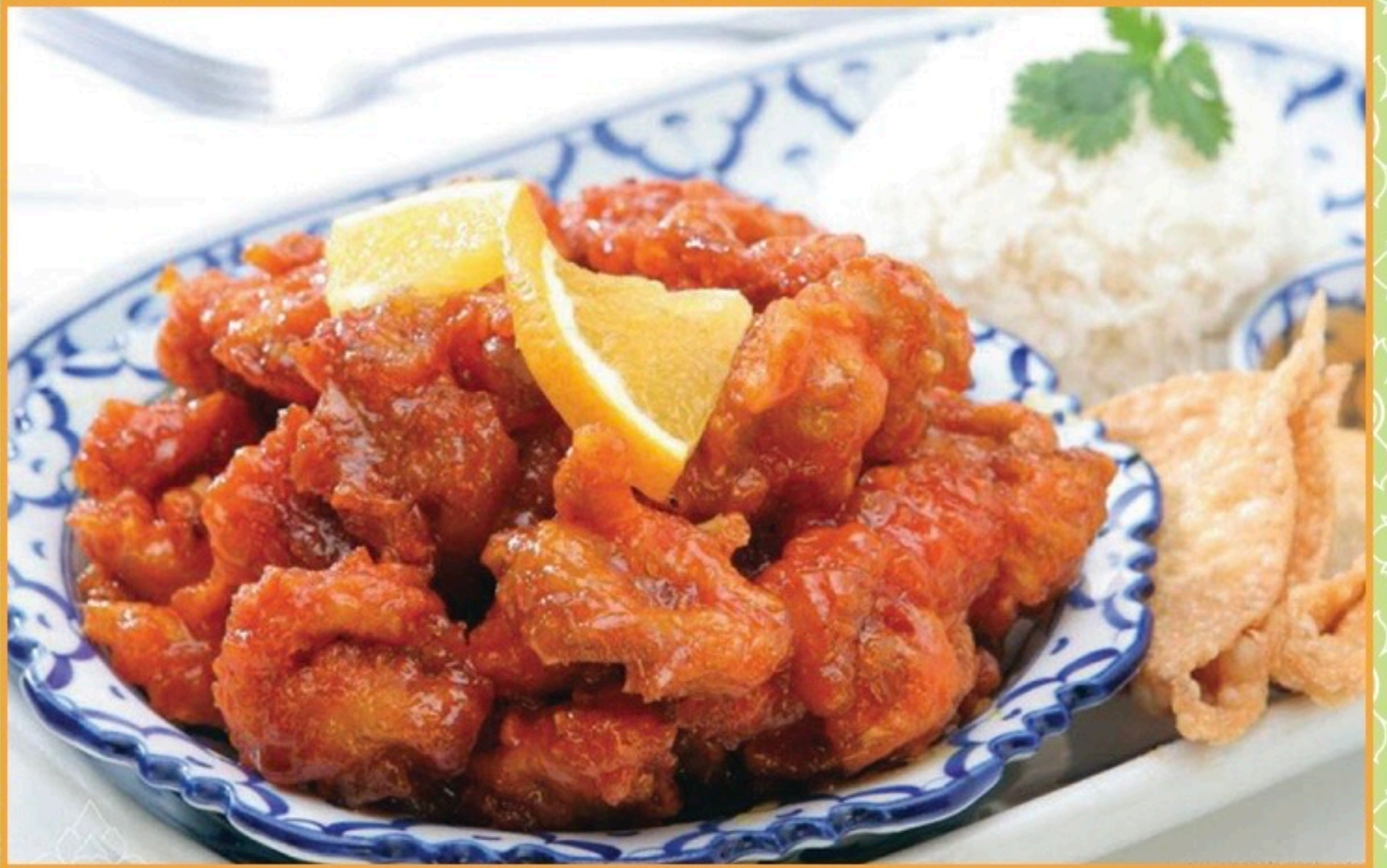
ORANGE CHICKEN $16.50