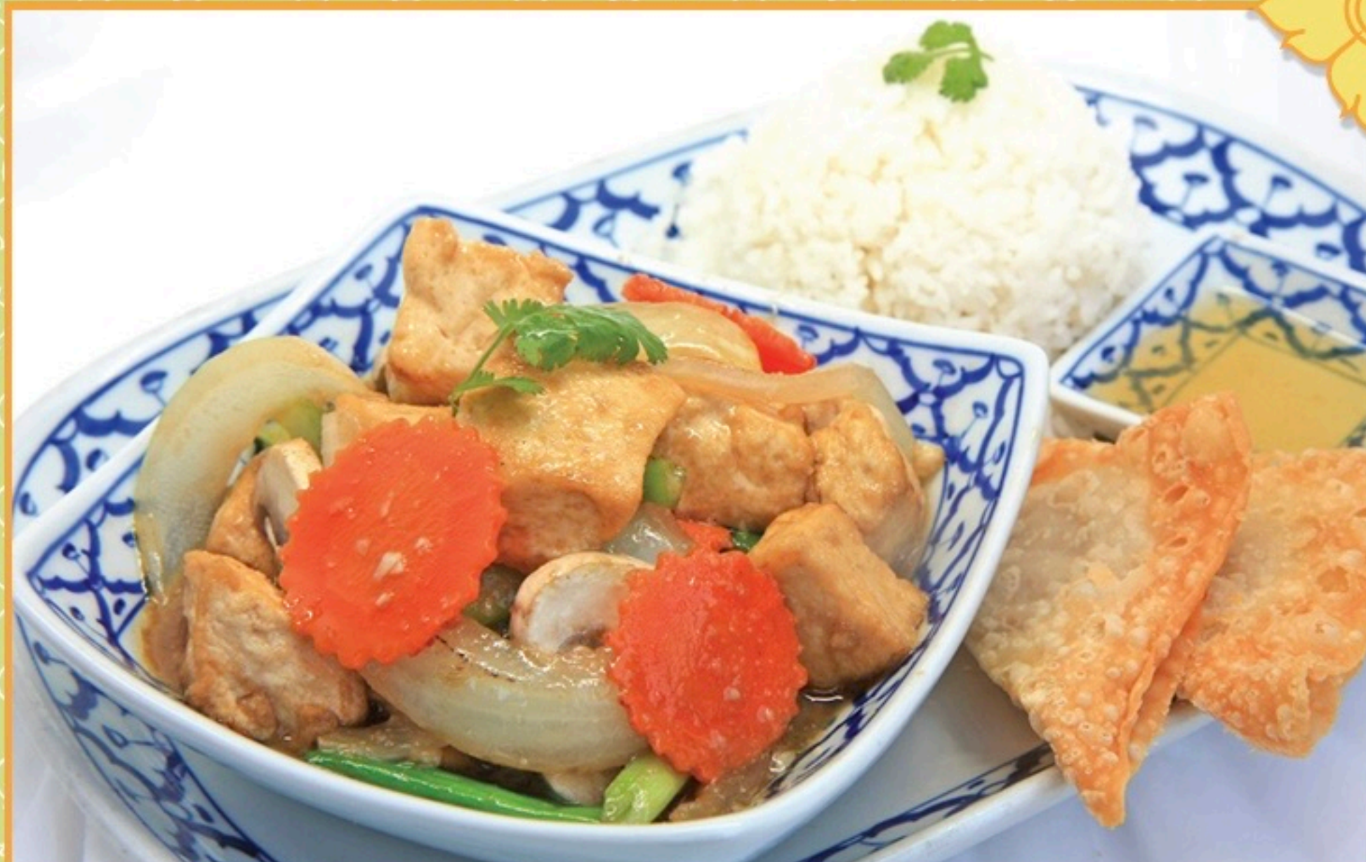
TOFU WITH MUSHROOM & ONIONS $16.50