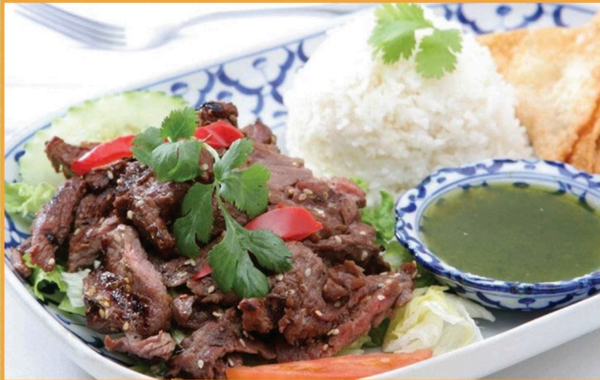
PRESIDENT'S B.B.Q BEEF