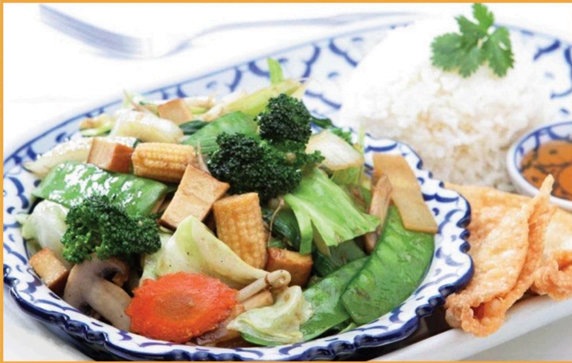
MIXED VEGETABLES IN A SAVORY SAUCE $16.50