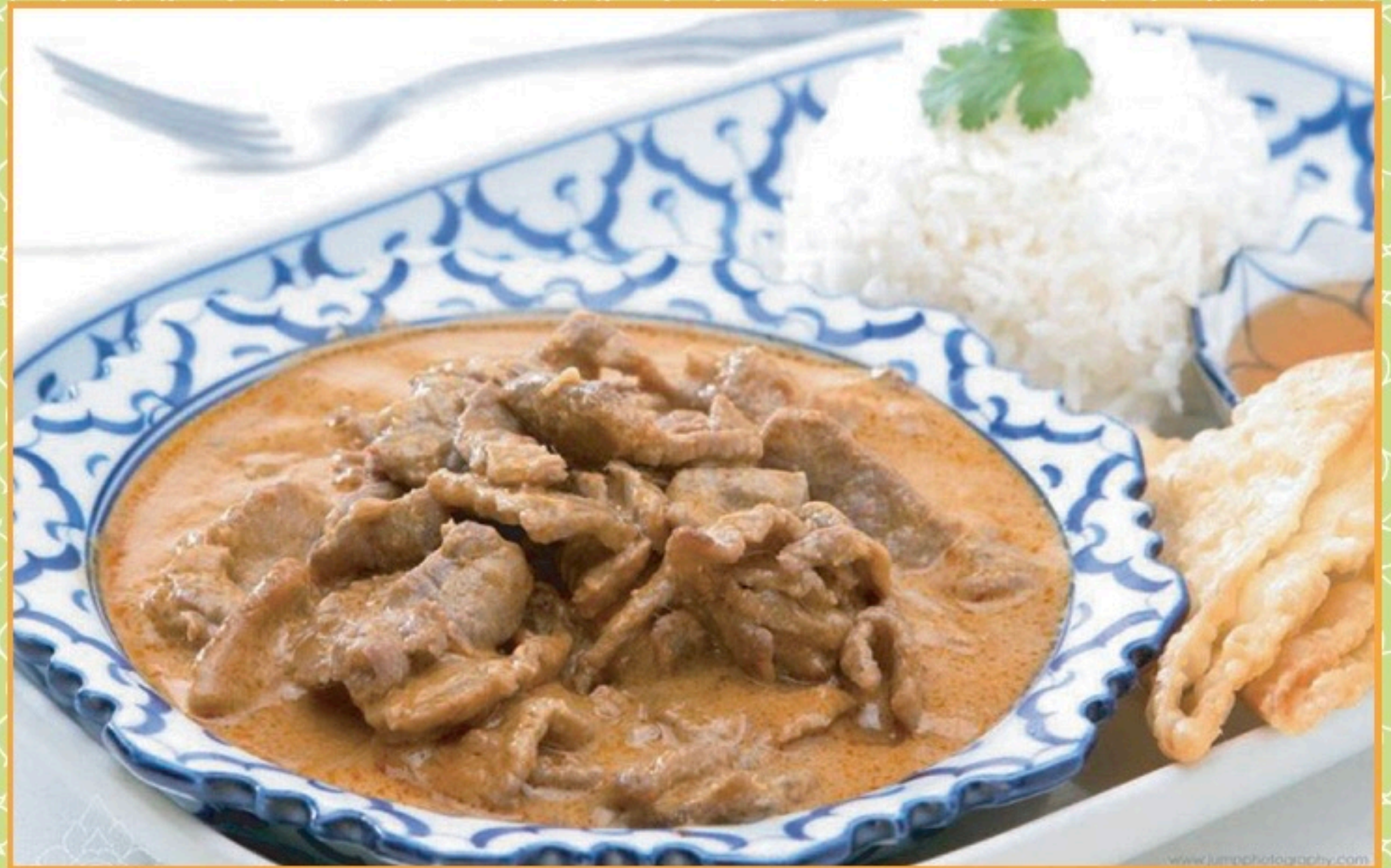
★ BEEF PANANG $16.50