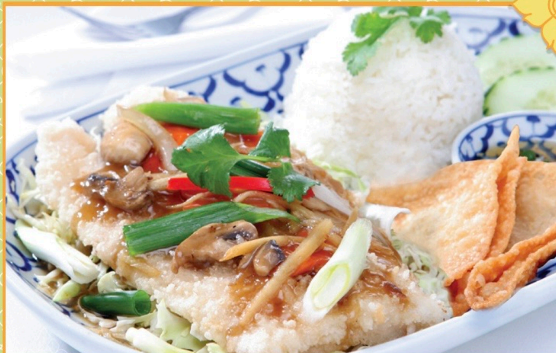
SOLE FILLET WITH GINGER & MUSHROOM $ 17.50